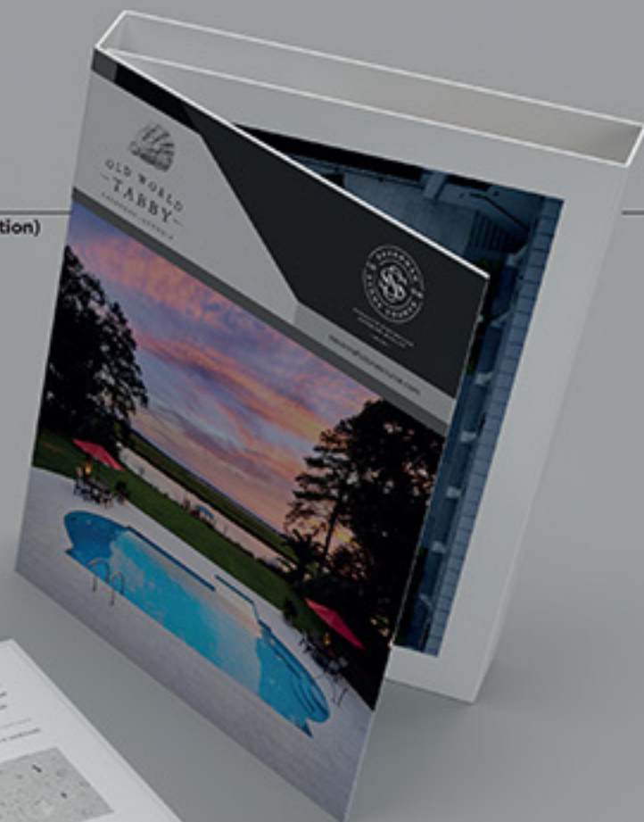
Binder OWT Concrete (Savannah Stone Source edition) 9"x11 1/4" . 23x28.5 cm