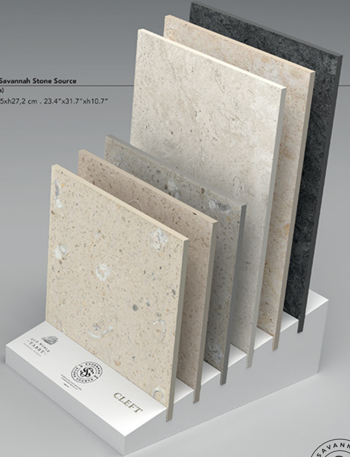
Display Savannah Stone Source (with tiles) 59,5x80,5xh27,2 cm . 23.4"x31.7"xh10.7"