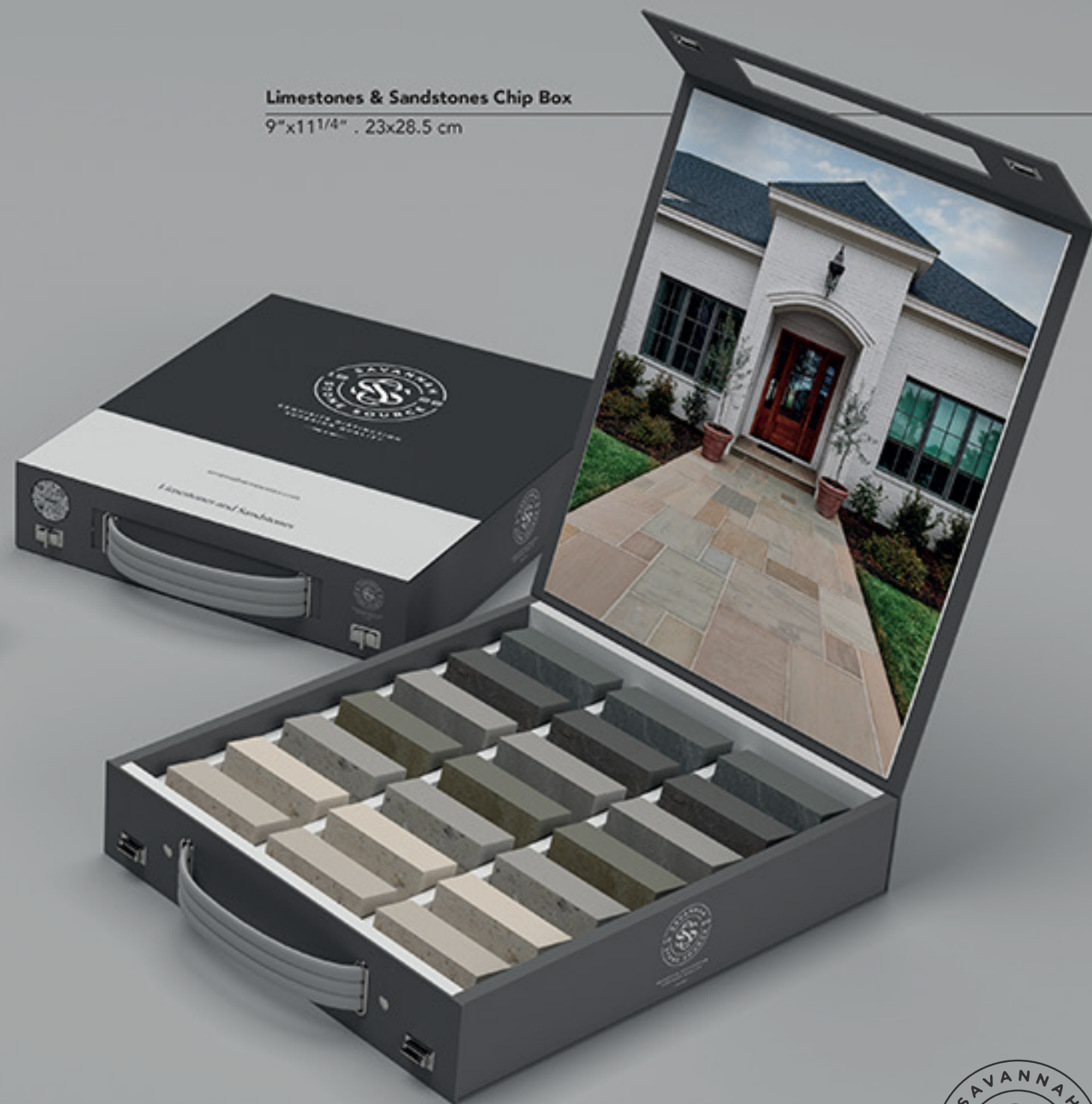
Limestones & Sandstones Chip Box 9"x11 1 / 4 " . 23x28.5 cm