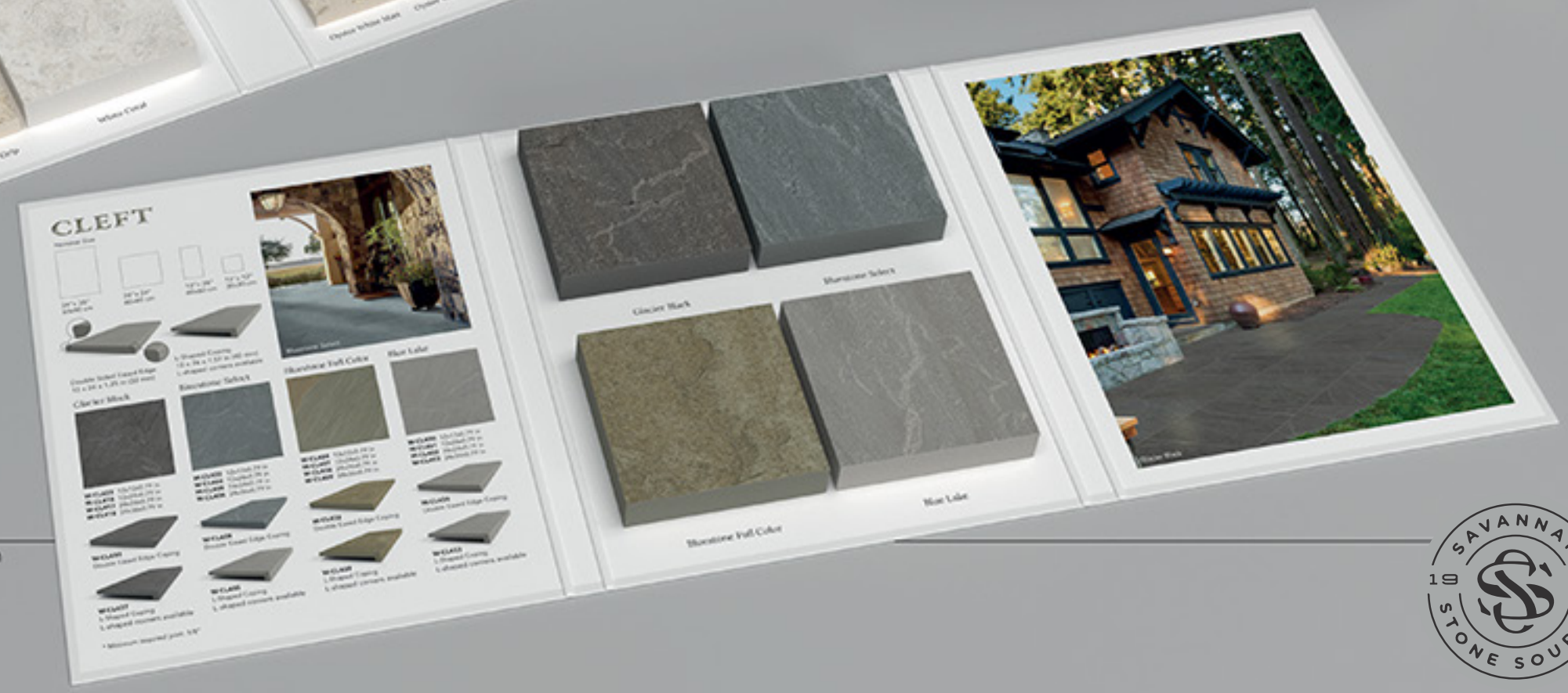
Binder Cleft 9"x11 1/4" . 23x28.5 cm