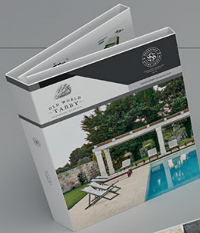
Binder Old World Tabby 9"x11 1/4" . 23x28.5 cm