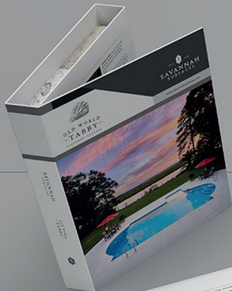
Binder OWT Concrete (Savannah Surfaces edition) 9"x11 1/4" . 23x28.5 cm