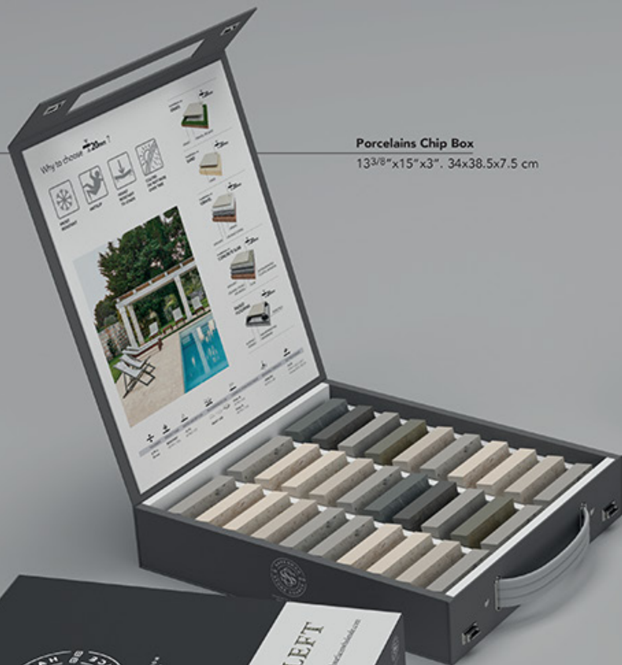
Porcelains Chip Box 13 3 / 8 "x15"x3". 34x38.5x7.5 cm